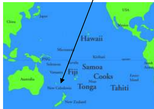
Where is New Caledonia????

So make sure your team spends time practicing your dances and songs, so you can be proud of your efforts in representing your country in New Caledonia, on and off the courts.