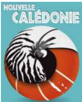
The Tournament Logo:

The logo is composed of a basketball that embraces a conch shell, which is a symbol of New Caledonia and of the Pacific islands.